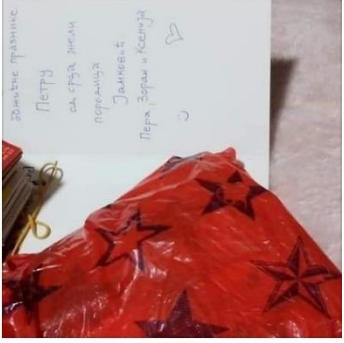
Facebook post by Srbija velikog srca

autism, who cannot go through a day without business cards. They calm him and bring joy to him. This post from the Facebook page of the humanitarian organization Serbia of Great Heart praises the Republic of Serbia Securities Commission for being the greatest support to the boy. The Commission employees have collected and sent to the