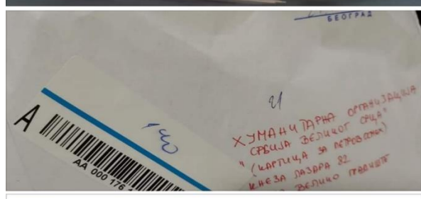
Facebook post by Srbija velikog srca

A BUSINESS CARD FOR PETER'S SMILE – is a standing activity of the